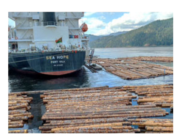
The permanent closure of the pulp line at Canfor's Prince George, B.C. mill was preventable, says Unifor.