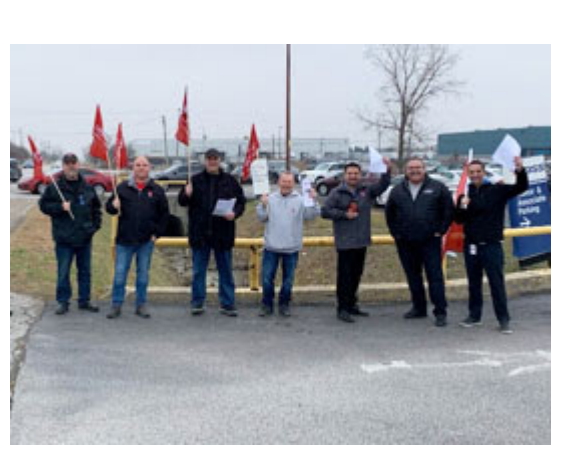
Momentum to unionize continues to grow across Canada's auto parts sector, after 600 workers at TRQSS Inc., a seatbelt manufacturer in Windsor, Ont., voted to join Unifor.