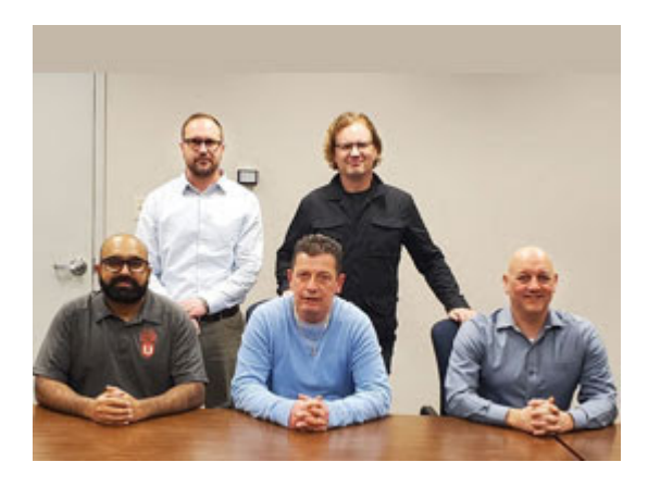
Unifor Local 101R has reached a tentative agreement with Canadian Pacific Railway (CP), covering 1,200 workers at 18 locations from British Columbia to Quebec.